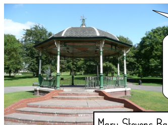
Mary Stevens Bandstand.

I wonder how many children through time have run in the park and played on the bandstand?