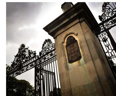
The War Memorial and Mary Stevens Park Gates are Grade II listed.

Timeline— the order in which events happened: