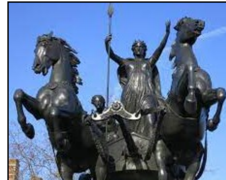
Queen Boudicca of the Iceni tribe.