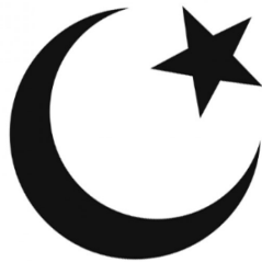
Islam: Crescent Moon & Star