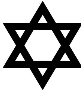
Judaism: Star of David